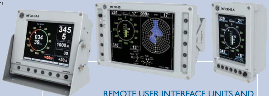
REMOTE USER INTERFACE UNITS AND MULTI-FUNCTION COLOUR REPEATERS